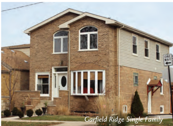
Garfield Ridge Single Family