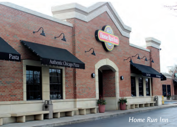
Home Run Inn