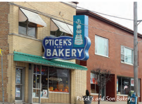
Pticek's and Son Bakery