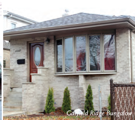
Garfield Ridge Bungalow