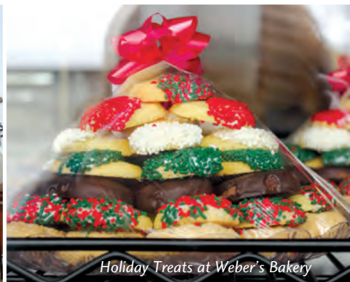
Holiday Treats at Weber's Bakery

European-style delis are also a staple in Garfield Ridge. Once serving only immigrants longing for a taste of the old county, these delis have gained loyal regulars who couldn't imagine lunch without them. Joe and Frank's Sausage Company (7147 W. Archer Ave.) is the community's preferred spot, offering an incredible selection of smoked and cured meats, cheeses, and traditional Polish pastries.